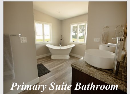
Primary Suite Bathroom