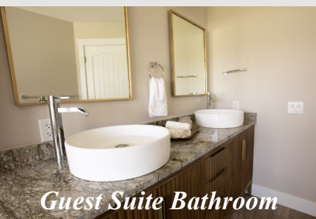
Guest Suite Bathroom