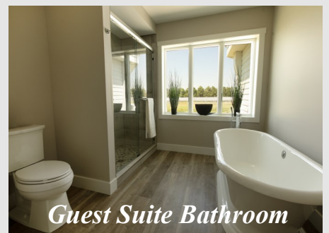
Guest Suite Bathroom