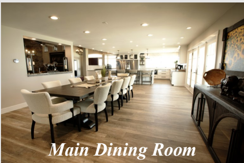
Main Dining Room