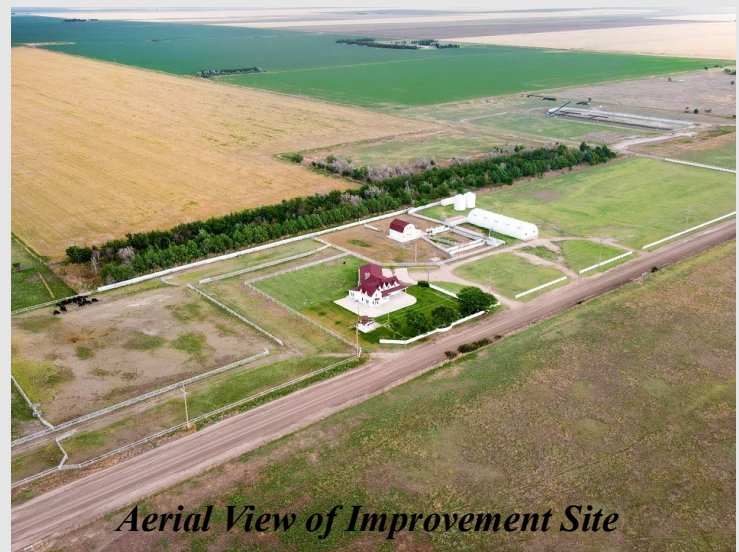
Aerial View of Improvement Site