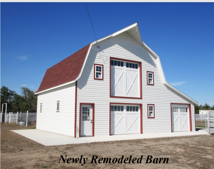
Newly Remodeled Barn