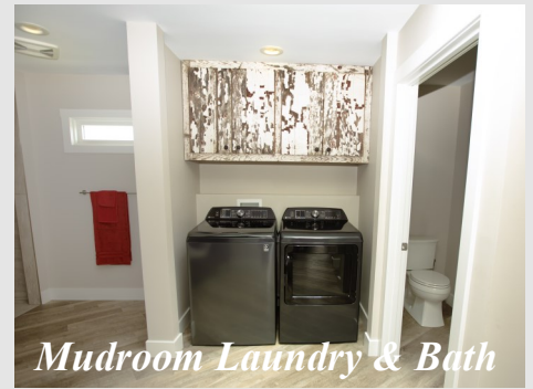
Mudroom Laundry & Bath