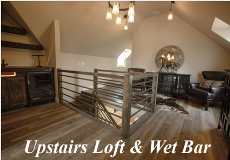
Upstairs Loft & Wet Bar