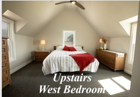
Upstairs West Bedroom