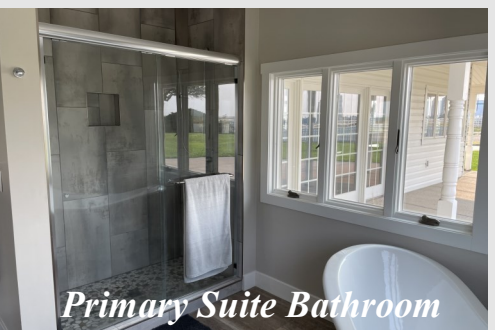
Primary Suite Bathroom