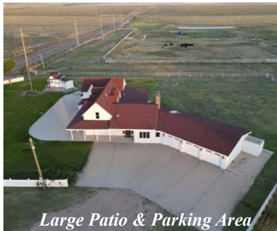
Large Patio & Parking Area