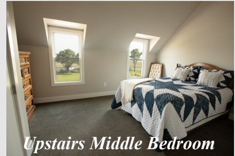
Upstairs Middle Bedroom