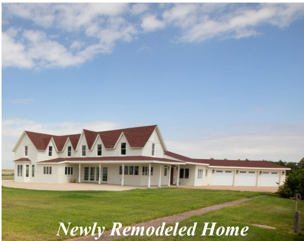
Newly Remodeled Home

Country living at its finest! This home has been completely remodeled. It offers (5) bedrooms, (4) baths, brand new kitchen with high-end appliances, great room with wood burning fireplace, formal dining room, office, (2) laundry rooms, (3) central heat & A/C units and a 3-car oversized garage (1,000 Sq. Ft.). This property also includes a playhouse, remodeled barn w/corrals, (2) cattle feeding pens, 41' x 120' Quonset building w/concrete floor & overhead doors and (2) grain bins w/pits. Call Rock Today!